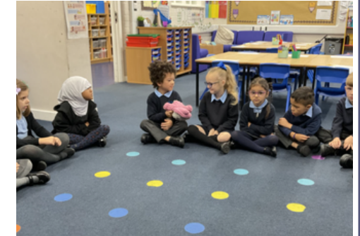
Learning more about one another in year 1

Take a look at some of the activities we have been doing this week. What an exciting start to the year!